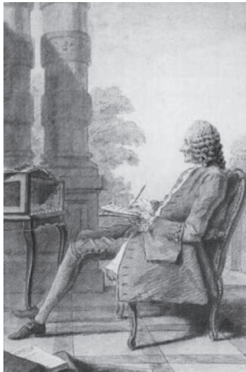
"Monsieur Rameau", painting by Louis Carrogis Carmontelle, ca. 1760

In 1741, Rameau published a set of five trios, "Pièces de clavecin en concert", setting the harpsichord as soloist, accompanied by violin and viola da gamba. Although serious solo literature for the harpsichord had existed for some two centuries at this date, in ensembles, the harpsichord was mostly used as a continuo instrument, with very few works existing for a written-out (or concertate ) harpsichord. Johann Sebastian Bach composed his seven concerti for harpsichord and strings in the 1730's and his son Wilhelm Friedmann also produced such works during the same period. However, Rameau likely took his inspiration more from Jean-Joseph Cassanéa de Mondonville's "Pièces de clavecin en sonates, Op.3" (1734), for solo harpsichord with an obbligato violin accompaniment. Rameau creates a new, dense texture with this combination of instruments. In the preface to the work, he states (perhaps not altogether sincerely?) that all of these pieces may also be performed by the harpsichord alone. He then provides a few brief suggestions for a certain number of pieces. He goes on, however, to explain that he himself has provided transcriptions of five pieces (Rameau is counting La Timide as two